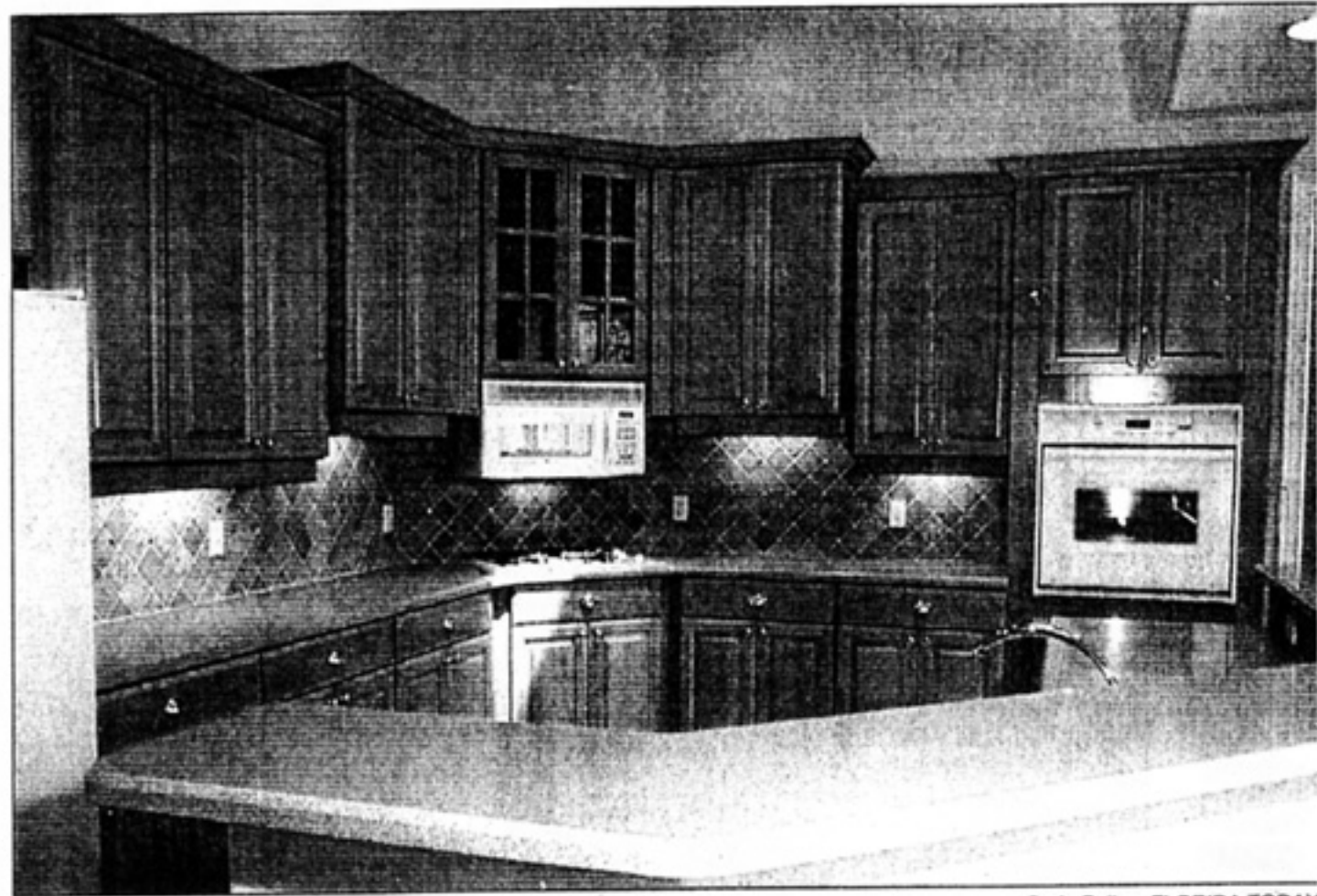
STERLING MODEL in the Rio Villa development in Indialantic has a large kitchen.

"Our home is only a block from Paradise Boulevard, so our kids like to tell everyone we're only two blocks from Paradise," Maddox said. "I like that."