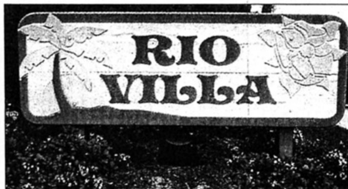
RIO VILLA is in its fifth and final stage of development.